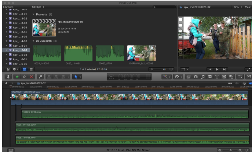
Figure 2: Same project in FCPX

when one listens to the recordings. It is easy to know that yes, this is the lapel mic of that speaker because it sounds like a lapel mic. However, the computer has no way of knowing this, and we probably would need to store this information in more machine readable format.