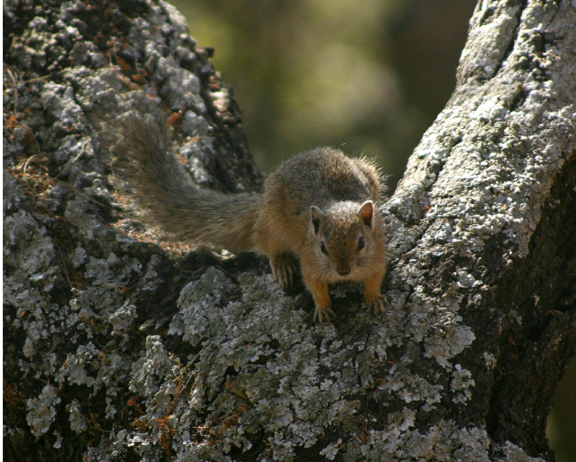
Figure 5: Some African squirrel in open domain

companions (Heider 2006), which means longer written document which explains the events in the film. Maybe we could employ something like that, explaining what happens in a recording, what are the topics covered, tying that into literature as well. For example, when people are talking about how they herded reindeer with the Nenetses and which languages they spoke in that context, one could associate that recording segment with the citations to different sources where this topic is discussed or mentioned. In my opinion this would add very much value to what we are doing. Of course this is enormous work and it can be difficult to convince people that this is worth the effort, but I'm moving to this direction myself anyway as I think it will be interesting.