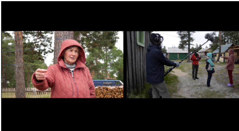
Figure 3: Two videos side by side

One advantage of multiple video is that it can be used to document what has been done. For example, with our recent data we have been experimenting with following setup (Blokland et al. 2016):